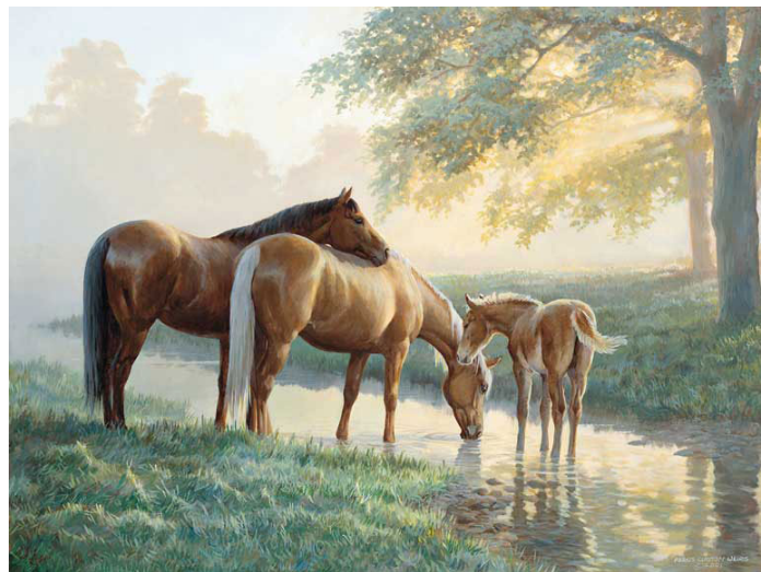
"Spring Morning Horses" By Persis Clayton Weirs

Chance to win a free class (of your choice) at the next horse show!