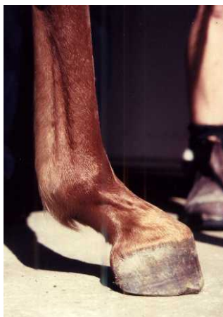
Club foot before surgery!