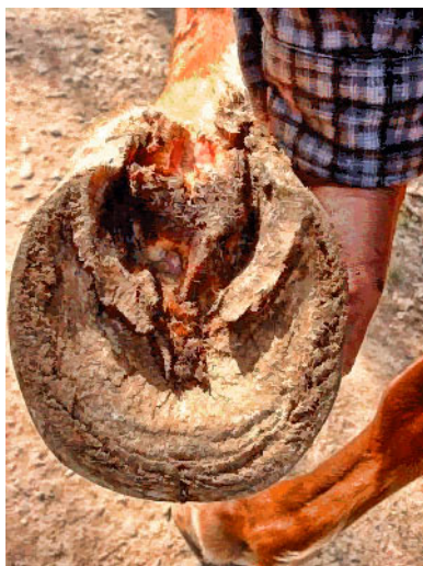
White Line Disease