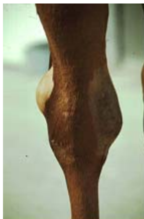
Distended hock joint "bog spavin"