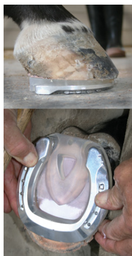
Hoof being treated for navicular