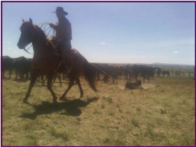
Pepped forthe Misses (Pepper) at his first branding!